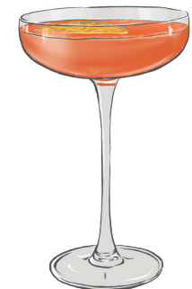
Sun-Kissed Virgin 14

Lyre's Agave Blanco, pineapple, lime, sugar and aquafaba.