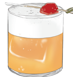
Sunset Sour 14

There's always room for dessert. Crème de Menthe, Cream de Cacao and cream of coconut. Finished with shaved mint chocolate.