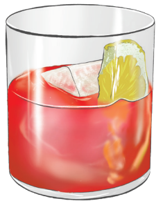
Davidson Plum Negroni

Lyre's Spiced Cane, mango, coconut, vanilla and lime.