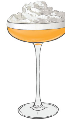
Mango Weis 14

A little number we put together because every cocktail list needs that blue drink. Vodka, blue curacao, aquafaba, ginger, lemon and apple.